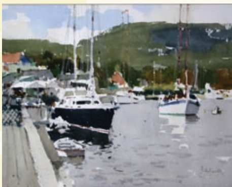
JOHN YARDLEY (British b1933) Windjammers at Camden Watercolour 30 x 40cm, signed