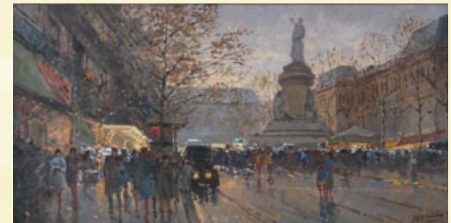
WILLIAM HEYTMAN (French 20th Century)