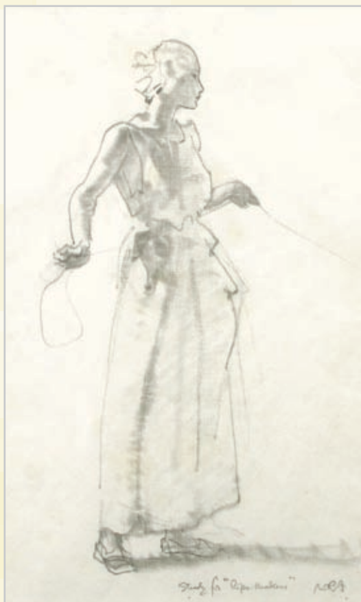
Sir WILLIAM RUSSELL FLINT (British 1880-1969) Study for "Rope Makers" Graphite drawing on Chartwell laid paper 22 x 15cm, initialled and titled